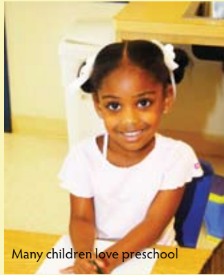
Many children love preschool