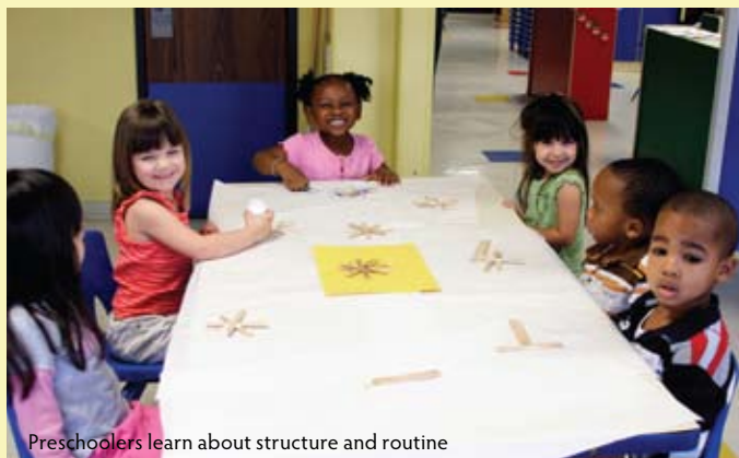
Preschoolers learn about structure and routine

The Balanced Learning Curriculum and the teaching techniques of the American Montessori Society are types of instructional formats also available in Sugar Land area preschools. With the wide array of options, parents can choose a preschool with a curriculum and teaching style that best suits their child's individual needs.