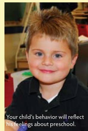
Your child's behavior will reflect his feelings about preschool.

Before considering a preschool, be sure that you know how the school addresses the issue of safety. What measures has the center put in place to protect its students? Are there locks on outside gates? Where does the center keep its cleaning chemicals? Are they out of the reach of the children? How does it maintain its restrooms and its kitchen? Does the center have a fire drill policy and a sprinkler system? Are background checks conducted before new employees start? Is the center child-allergy conscious? Safety encompasses more than a visitor sign-in policy.