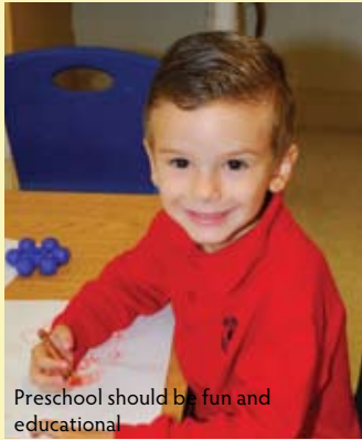
Preschool should be fun and educational