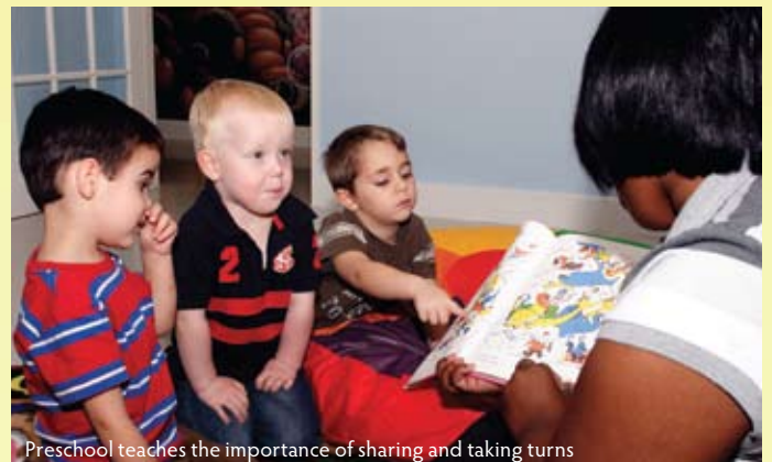
Preschool teaches the importance of sharing and taking turns

Separation from a parent is tough. If you know that your child will have difficulty being without you, weaning her off before enrolling her would definitely make it easier on both of you when she does become a preschooler.