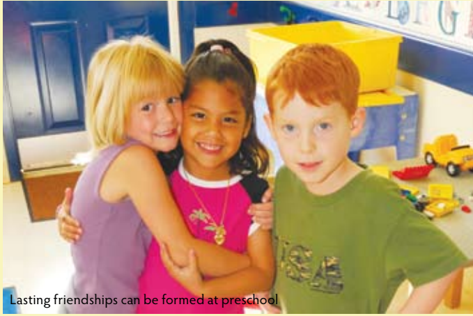
Lasting friendships can be formed at preschool